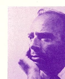
SUMNER LOCKE ELLIOTT